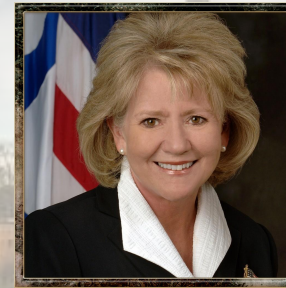
Mary E. Peters Mary Peters Consulting; Former U.S. Secretary of Transportation